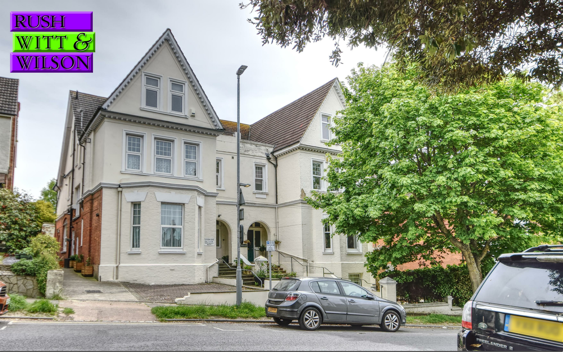
Flat 1, St Brendans Upper Sea Road, Bexhill-On-Sea, East Sussex TN40 1RL £295,000